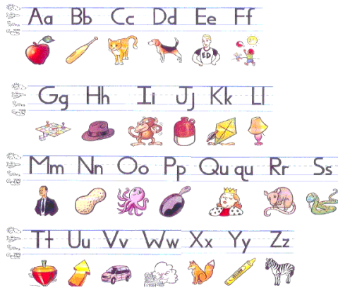
A phonics sound card